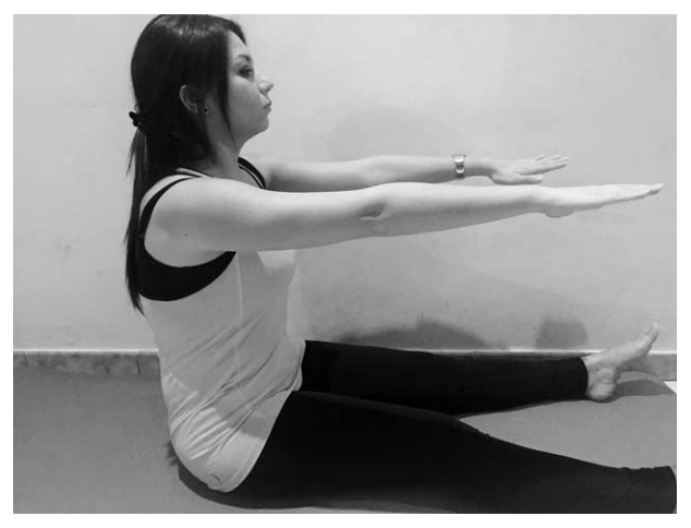
FIGURE 6. Pilates exercise - Spine Stretch.

traditional Pilates mat exercises in improving body composition, muscle endurance, and flexibility. We confirm these findings, providing evidence that a 14-week program of Pilates exercise is sufficient to modify posturography in individuals with chronic NSLBP. In their 2012 study, Bird et al<sup>33</sup> indicated an improvement in static and dynamic balance in elderly individuals after a 16-week Pilates program. They also reported lowering of pain perception, confirming previously reported benefits of Pilates on pain.<sup>34–37</sup> Gladwell et al<sup>38</sup> reported a 6week program of Pilates exercise as being sufficient to improve general health, pain, flexibility, and proprioception in individuals with chronic LBP. In 2014, similarly, Natour et al<sup>20</sup> demonstrated the added benefits of Pilates exercises in reducing pain in patients with LBP using NSAIDS. Our data in fact demonstrated the effectiveness of a Pilates intervention in achieving higher pain reductions than a group of individuals using NSAIDs. In conclusion, the Pilates exercise protocol we