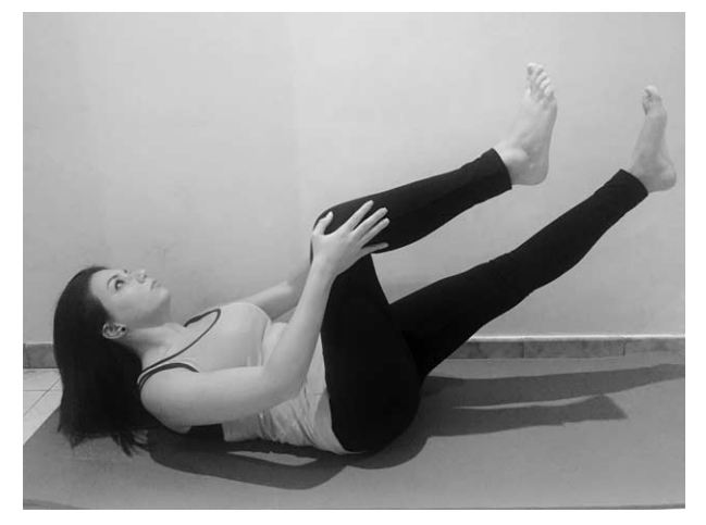
FIGURE 7. Pilates exercise - Single Leg Stretch.