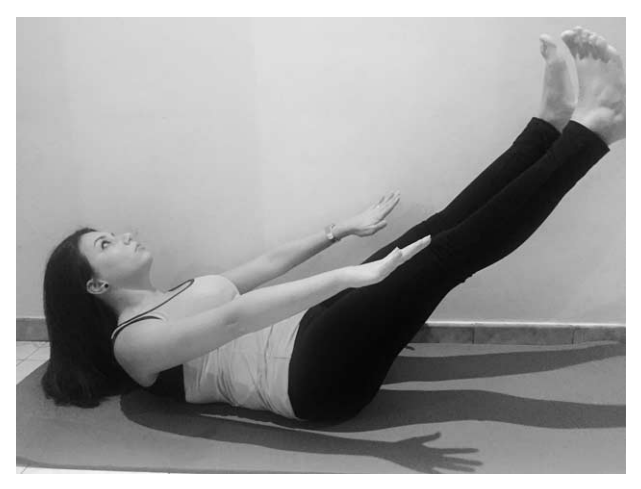
FIGURE 3. Pilates exercise - The Hundred.