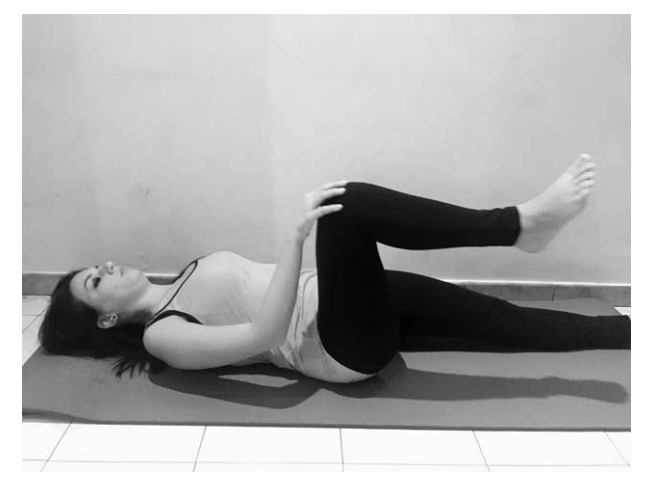
FIGURE 5. Pilates exercise - Single Leg Circles with bent leg.